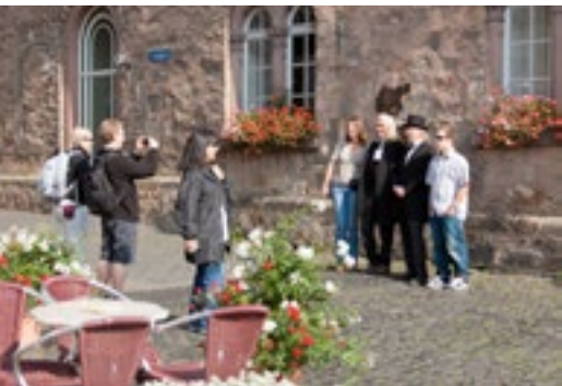
Favourite photo motives - the Wine house...