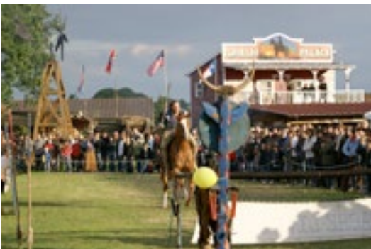
The Wild West Town of Lingelcreek