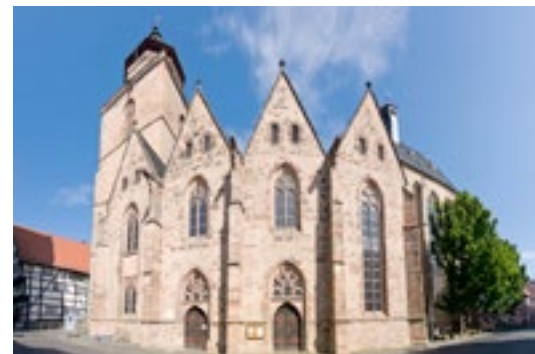
The Walpurgis Church, the main parish church of Alsfeld

Welcome to a town where the wood timbered architecture is a feast for your eyes!