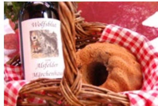
Little Red Riding-Hood Presentation Basket