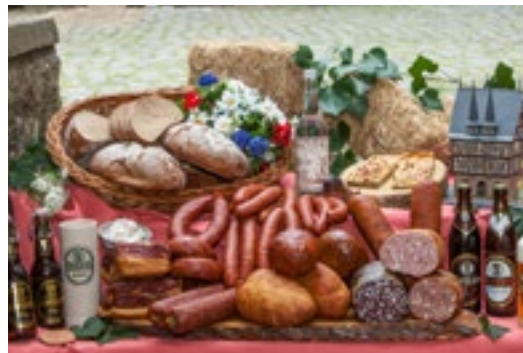
Specialities from Alsfeld