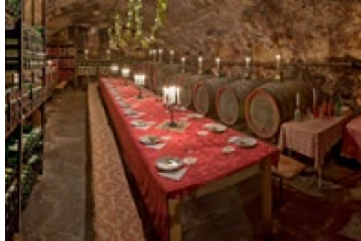
Historical wine cellar.