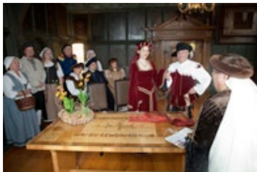
“The best day of your life” in Alsfeld