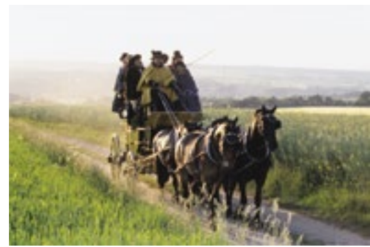
Post coach ride

As wonderful as the historic old town, so charming is the surrounding landscape.