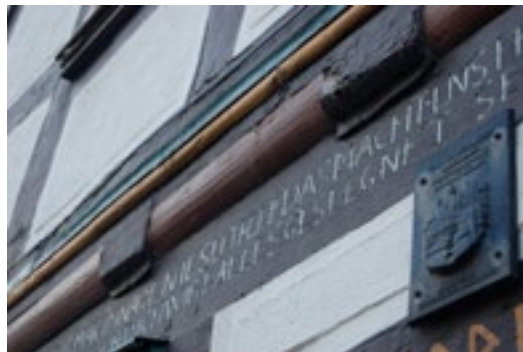
Inscriptions can be found on many houses