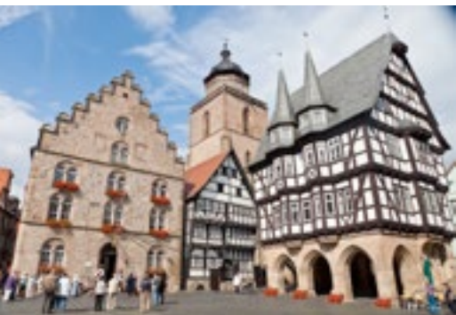
The famous Market Place Trio of the Town Hall, the Wine House and No.2 Market Place

European model city for heritage building conservation.