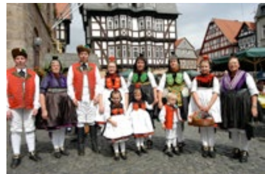
Little Red Riding Hood Week celebrated in Little Red Riding Hood Country

The people in Alsfeld know how to celebrate and would like to invite others, because the more the merrier.