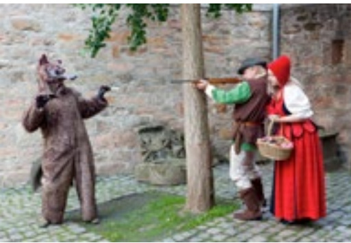
Little Red Riding Hood enacted in the Museum yard.