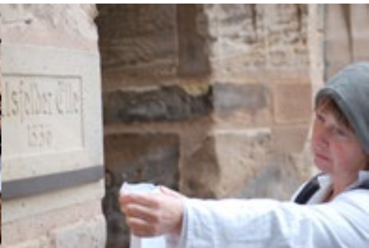
The 60cm long Alsfeld cubit on the Town Hall.