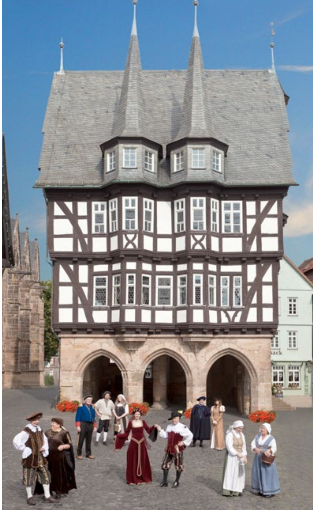
The Regional Museum with the Neurath and Minnigerode Houses.