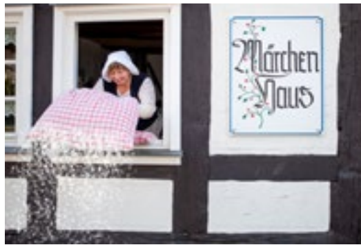
Mother Holle shaking out her bedding.