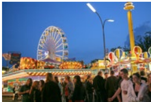
Alsfeld Pentecostal Fair – The biggest Carnival in the Region