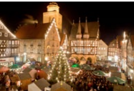
Alsfeld Christmas Market