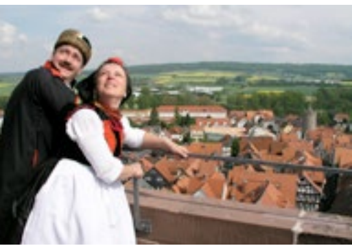
A view from the Church Tower

Rustic Wood Timbers meet idyllic green landscapes