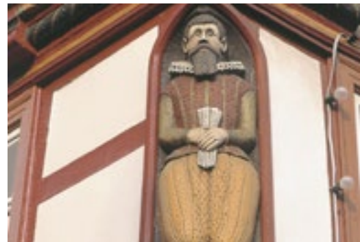
Wooden carving on one of the earliest half-timbered buildings.

Only a few steps further on is the Alsfeld Cubit – exactly 60cm long.