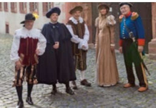
Guided tour in historical costumes