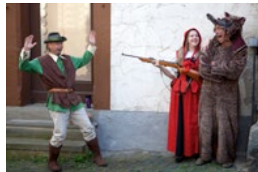
For you we'll portray any character...

Authentic, unusual, surprising and fascinating... In short, Alsfeld is different, Alsfeld is a sensation!