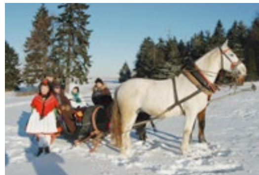
horse-drawn sleigh ride