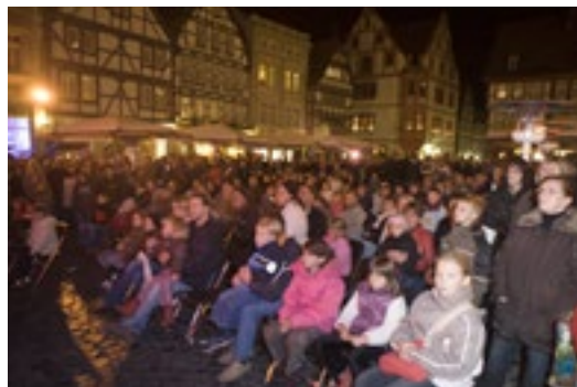
Magic and Variety Show during the "Bewitching Night"