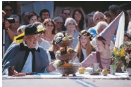
Celebrating like they did in the 16th Century.