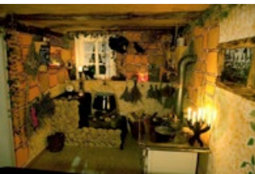
The witch's kitchen