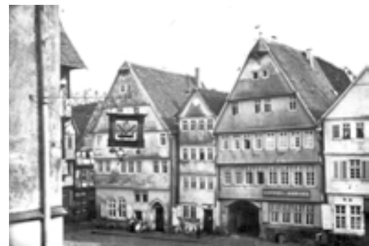
Bücking House on the Market Place (1893)