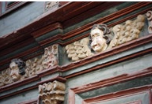
Angel's heads incorporated in wooden beams