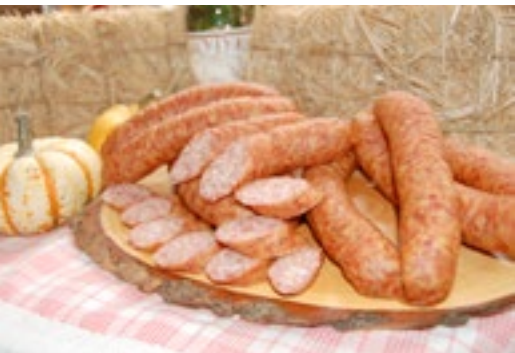
Alsfeld potato sausages