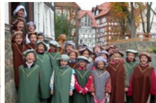
Children's adventure Tour