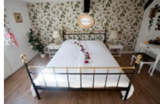
An enchanting overnight stay