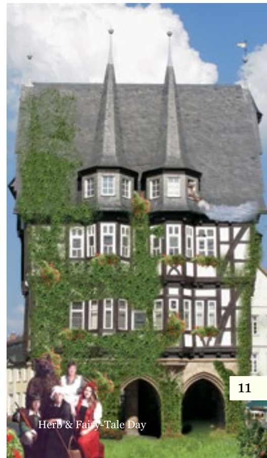
Herb & Fairy-Tale Day

In December the Market Place and the old town are lit up with Christmas lights. The 10 day legendary Christmas Market entertains all who come to enjoy the music, stories and plays. Mother Holle will delight young and old alike.