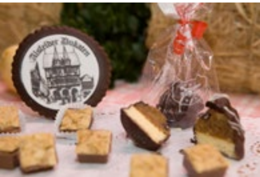
Sweet tempting morsels, Alsfeld kisses, ducats and plaster stones.

Alsfeld like love, passes through the stomach!