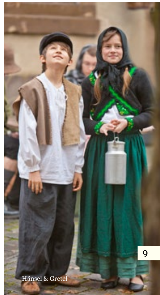
Hänsel & Gretel