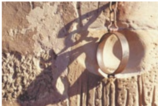
An instrument of punishment in the middle ages - the pillory.