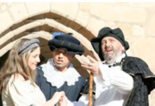
Alsfeld Town Players.