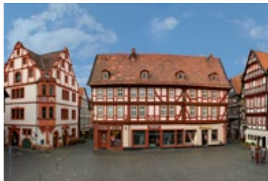
The Wedding House, The Stumpf House and The Bücking House