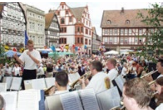
Alsfeld Town & Country Fair