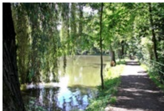
Circular walk around the Erlen Pond