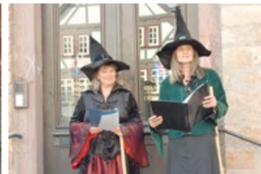
Witches, Healers & Herbal Women