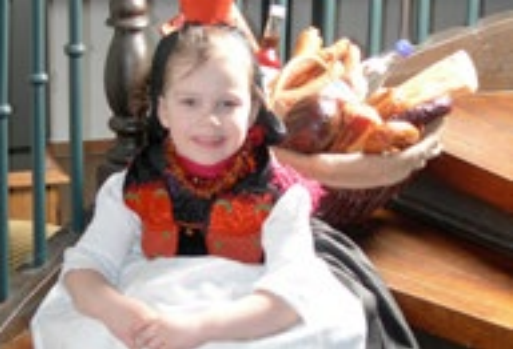
Little Red Riding Hood smiles at everybody