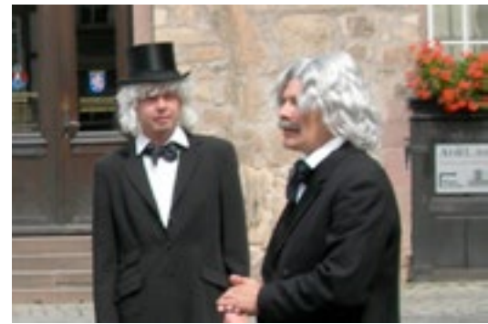
A fairy-tale guided tour through the town with the Grimm Brothers.