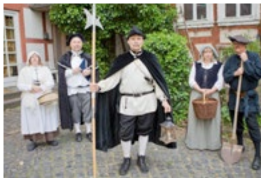
A tour with the night watchman on his rounds.