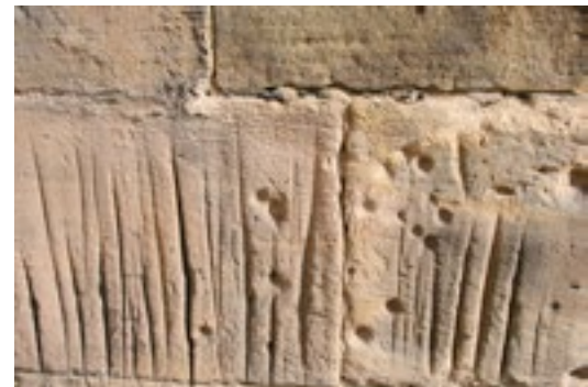
Mysterious groove markings in the sandstone.

On a stroll through the Alsfeld old town, you will come across symbolic, artistic and mysterious features at every corner.