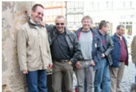
... and the pillory.