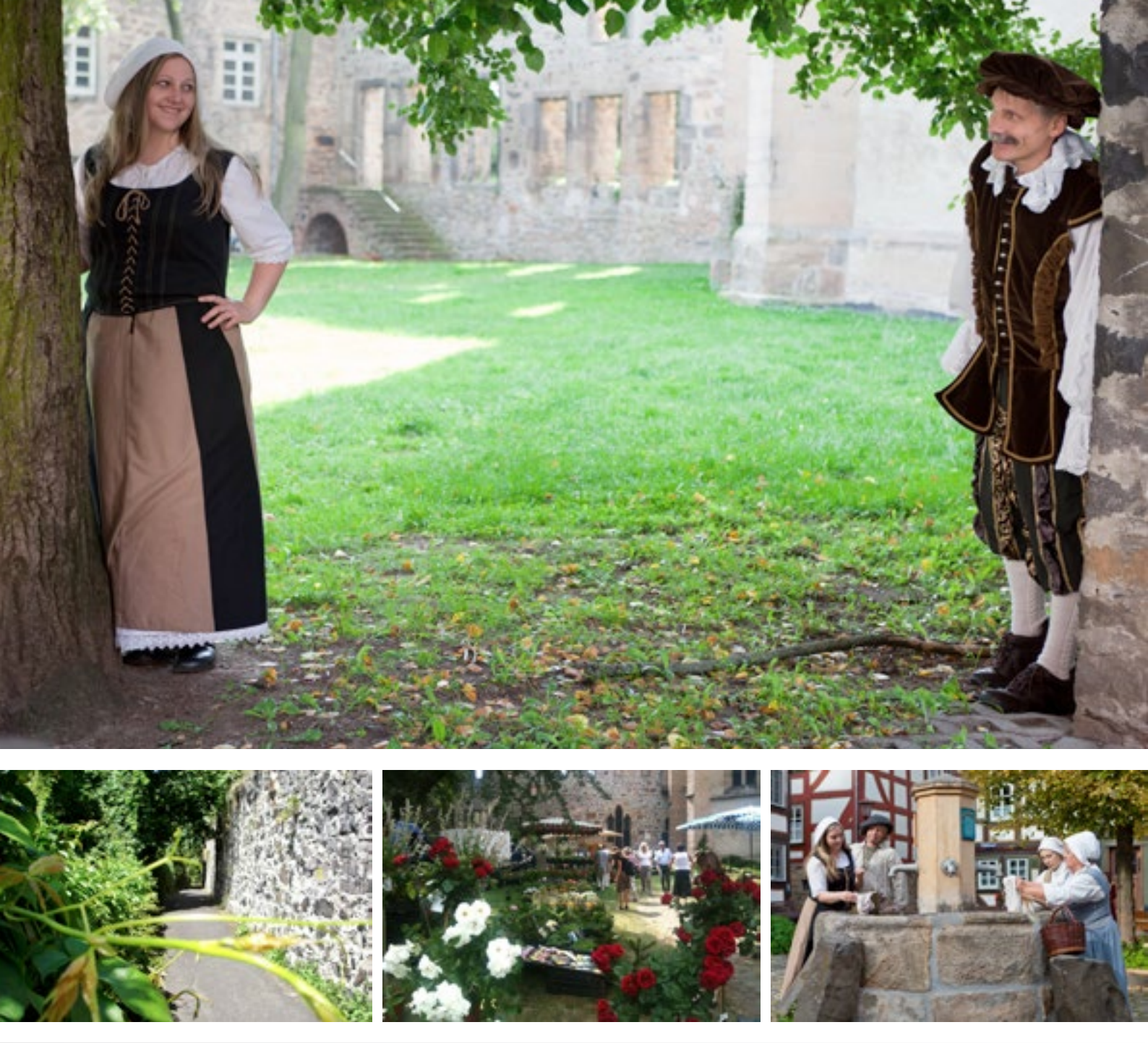
Old Town Wall beside remains of the ancient cloister