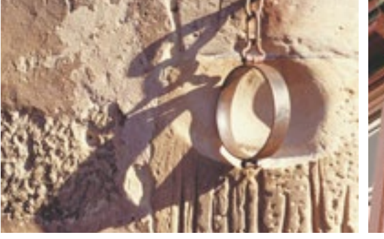
An instrument of punishment in the middle ages the pillory.