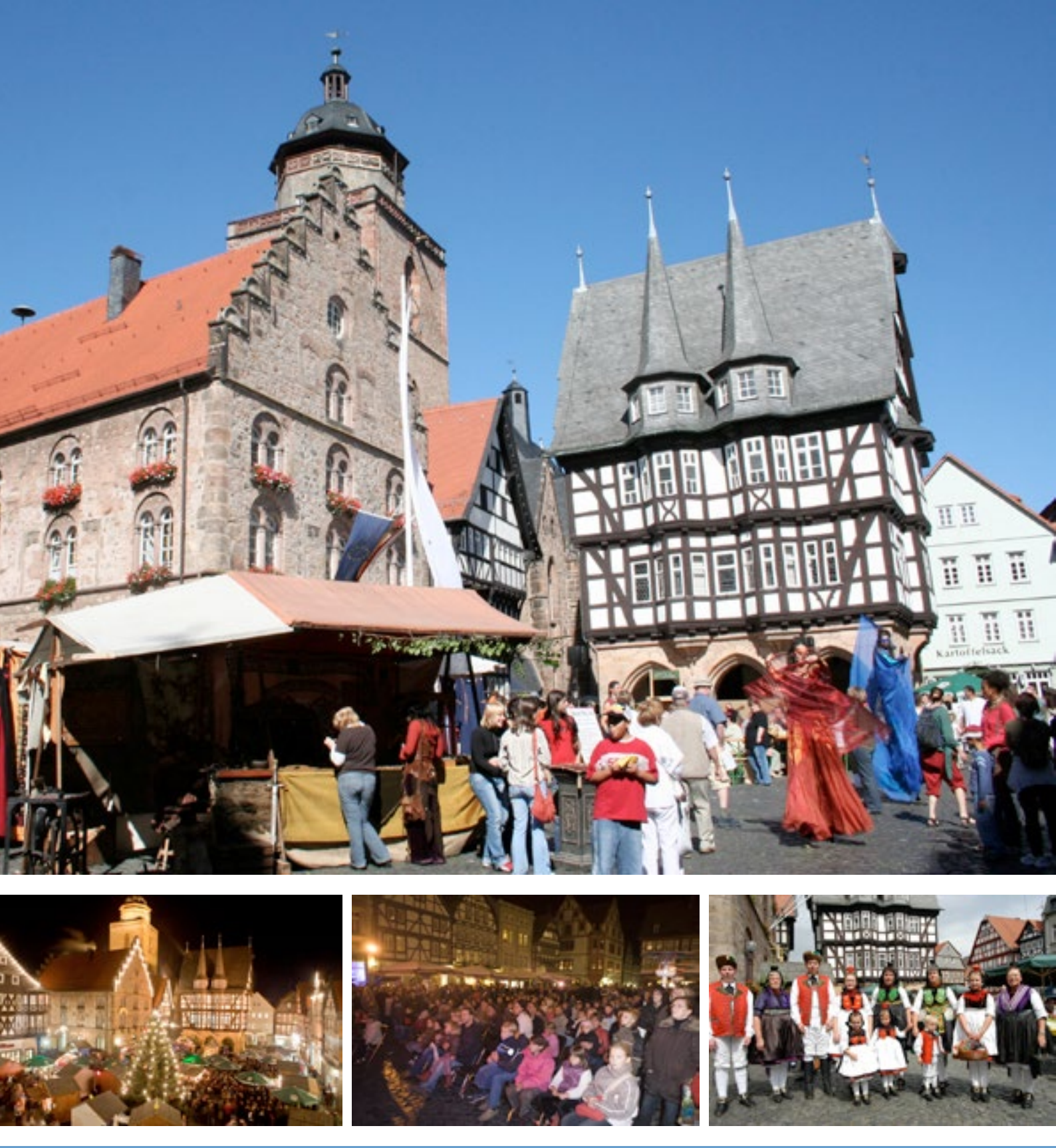
Alsfeld Christmas Market