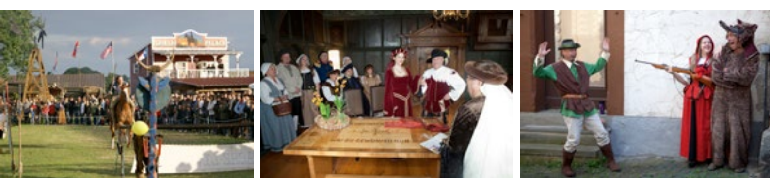
The Wild West Town of Lingelcreek