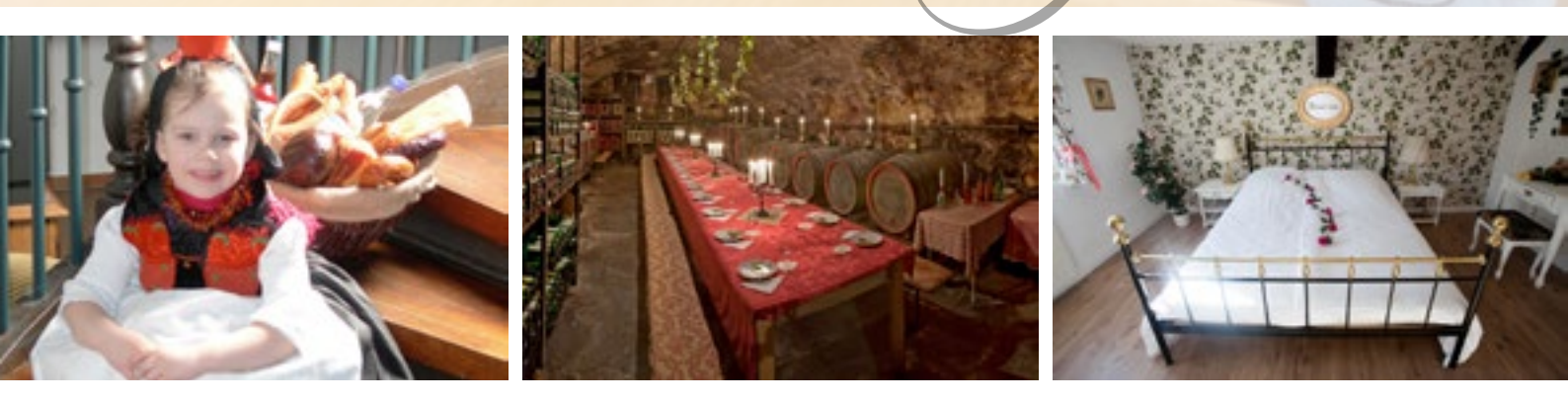
Little Red Riding Hood smiles at everybody