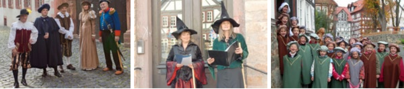
Guided tour in historical costumes