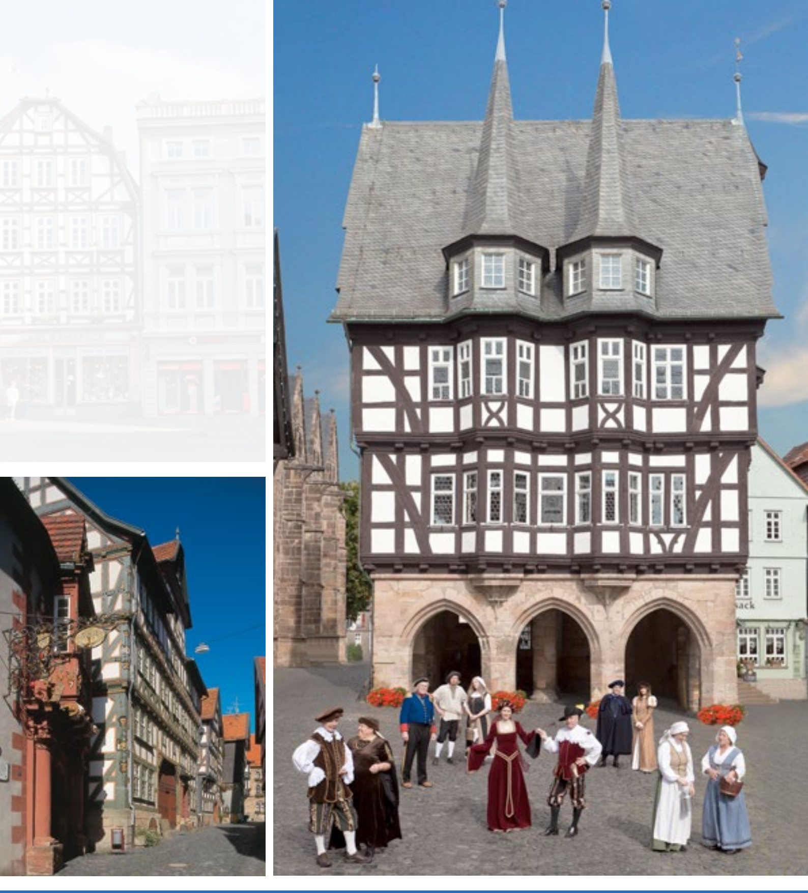
The Regional Museum with the Neurath and Minnigerode Houses.