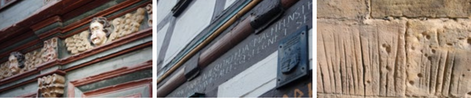
Angel's heads incorporated in wooden beams

Inscriptions can be found on many houses