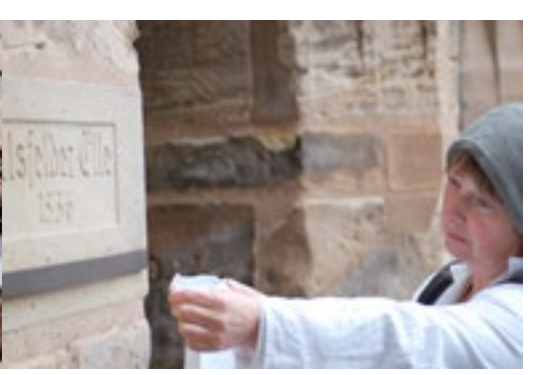
The 60cm long Alsfeld cubit on the Town Hall.